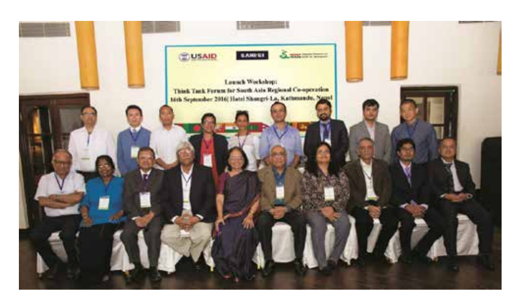
Launch workshop of SARI/EI Think Tank Forum for South Asian Regional Cooperation on 16th September, 2016 at Kathmandu, Nepal

The Launch Workshop; 'Think Tank Forum for South Asia Regional Cooperation" was organized on 16th, Sep 2016 at Kathmandu, Nepal. Diverse and dynamic group of participants from 13 Think Tanks and 6 South Asian countries viz., Bangladesh, Bhutan, Pakistan, Sri Lanka, Nepal and India and representatives provided in-depth insights, as well as, actionable and practical suggestions which will be considered for further evolving Think Tank Forum for South Asia Regional Energy Co-operation.